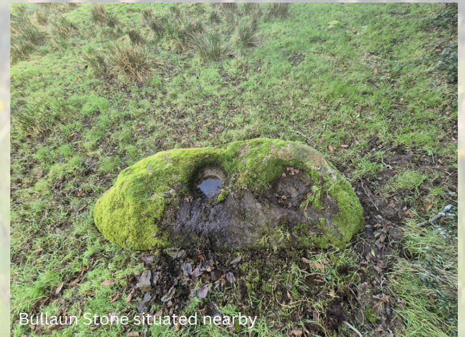
Bullaun Stone situated nearby