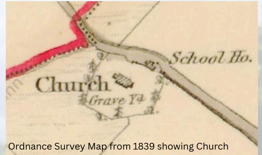
Ordnance Survey Map from 1839 showing Church