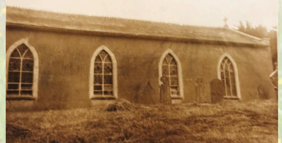
A side view of the old Catholic Church