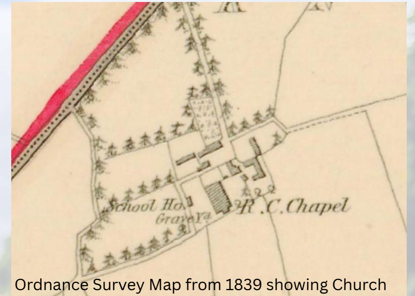
Ordnance Survey Map from 1839 showing Church

As you explore the graveyard take note of the various different types of memorials and their design with many displaying beautiful iconography and stone carving. Memorials can also be seen affixed to the surviving wall of the ruined church. The oldest grave recorded in the Old Catholic Graveyard is a headstone erected by Stephen Fleming, in memory of his son Thomas Fleming, who died on 24th October 1819 age 22 (No.28). There are also many unmarked graves within the old graveyard with just simple stone markers for which no date is known. Post reformation the site church at Ballinaberry continued to be used as a place of burials for Catholics until at least the early 18th century.